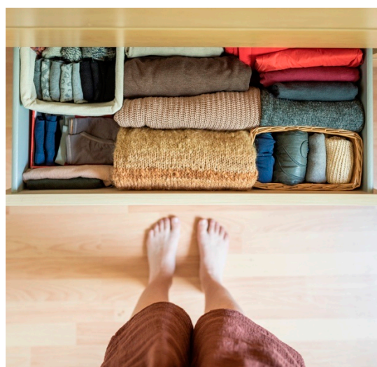
Figure 3. Instagram post of Lia’s drawer, June 2020.

On June 29th 2020, Lia posted a picture of her drawer on her Instagram account (Figure 3). The photo looks significantly different from the photo taken at the wardrobe interview on the 10th of April 2019 (Figure 2) concerning aesthetics, order, colours and in general: beauty. In his book The Longing for Less , art historian Kyle Chayka describes “its aesthetic of fashionable austerity” [35] with an imagery of “clean white subway tile, furniture in the style of Scandinavian mid-century modern, and clothing made of organic fabrics” [35]. The style that he traces back to the American avantgarde art movement of the 1960s now turned into “generic luxury style” [35]. For Chayka it reappears perfectly adapted to internet and social media today as it matches or competes with website backgrounds through “subtle qualities” [35]. Chayka’s book is one of the critical voices towards minimalism. More often writing about minimalism and their sustainable practices has the tendency to glorify the sustainable impact of minimalists and overemphasise their influence. It is therefore important to introduce a first restriction in the discussion section that deals with the difference of Instagram and media representations of minimalism and the households taken part in our study.